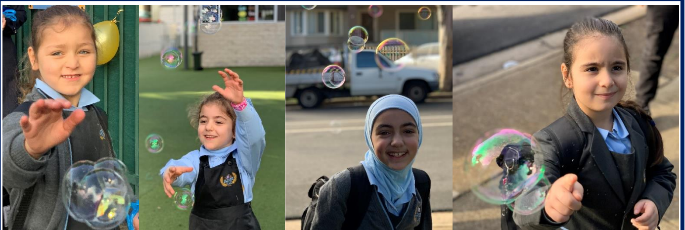
BACK TO SCHOOL – SMILES AND LAUGHTER AT THE SCHOOL GATE